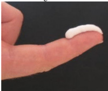
Pic. 1. Dosage unit of local corticosteroids — FTU

Note. FTU (fingertip unit) - a unit equal to the fingertips.