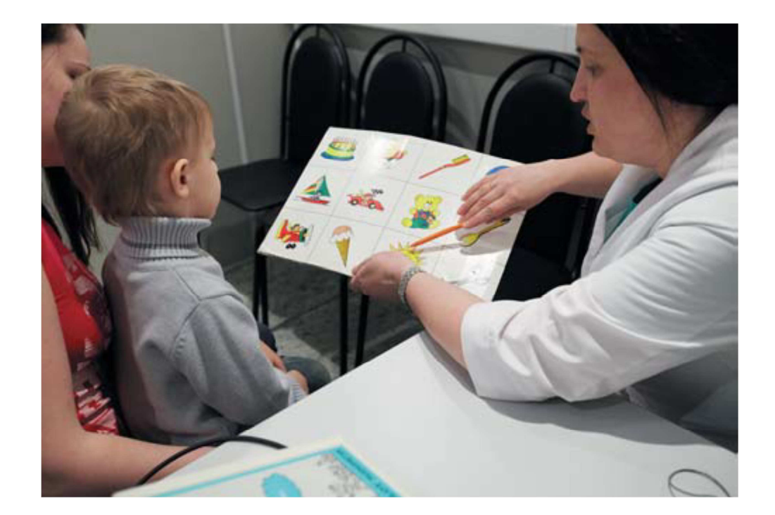
Pic. 2. Surdopedagogical treatment in surdochamber.

Scientific Center of Children's Health could not stand aside and not use its unique technological capabilities to solve this problem. Department of medical rehabilitation of children with diseases of ENT-organs and maxillofacilal area with a unique surdochamber has been functioning since January 2012, where not only the treatment of children with acute and chronic pathology is conducted, but also auditory analyzer diagnostics of children from birth to 18 years of age, hearing aid, surdopedagogical treatment (pic. 2).